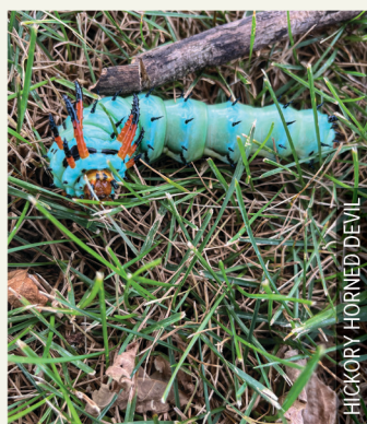
HICKORY HORNED DEVIL