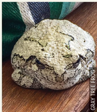
GRAY TREE FROG

Who knows? You just might be a nature nerd in the making! And planet Earth can always use more nerd devotees! In today's society, it is cool to be smart and passionate about a single-minded interest. There is even an official day in August dedicated to Finding Your Inner Nerd. But any day is okay to recognize what makes you happy and gives you a chance to share it with the world. When your passion earns you the NERD label, wear it proudly! (Bow tie, oversized glasses and pocket protector are optional!) ●