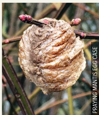
PRAYING MANTIS EGG CASE