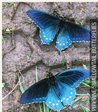
PIPEVINE SWALLOWTAIL BUTTERFLIES